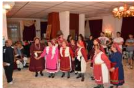
Figure 10: Asproklisia (Trikala) (2013)

The organisers are aware of the challenges that arise due to the limited time of the workshop, and therefore, in order to fill the gaps within the songs and costume presentation, they adopt a practice of inviting local dancers, who represent local style of the community by demonstrating their traditional costumes. During this type of performance, participants either dance in a second (outer) circle imitating the dance of the locals and humming the lyrics, or they remain seated while they watch the locals dancing and singing (see figure 10).