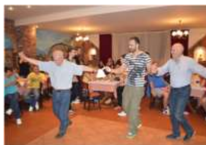
Figure 5: evening feast (2013)