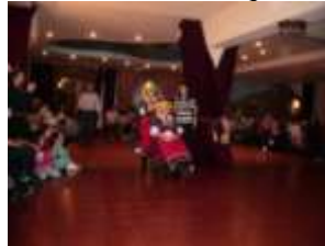
Figure 8: Aiani (Kozani) (2011)

Some of the practices applied during the workshop include: inviting locals to wear traditional costumes, presenting the process of dressing into the traditional costume in its relation to the dance material, as well as costume exhibition within the workshop space (with the use of mannequins).