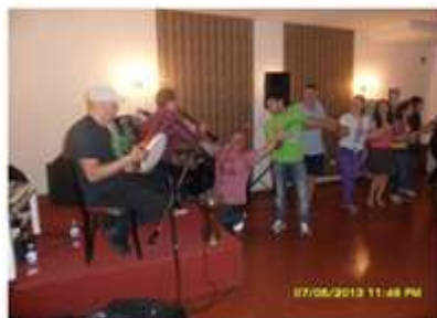
Figure 2: evening feast (2013)

Every night, participants, accompanied by a music band representing the style of each region, repeat the dance repertoire they are being taught during the classes (see figures 2 and 3). This way, they are given a chance to repeat, practice, assimilate, and enjoy dance repertoire, taught during each training day, alongside the instructor or local authentic dancers.