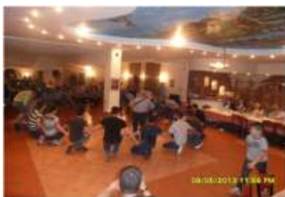
Figure 4: evening feast (2013)

Furthermore, the participants were interested in acquiring ethnographic knowledge from local people, meeting and getting in contact with colleagues and dancers, having access to teaching material, exchanging opinions and achieving a better understanding of the dance. Other reasons for participating in the workshop were acquiring deeper knowledge of other geographical regions, cross-checking information to get more details, meeting people who share the same interest and love for tradition, but also the curiosity on how the workshop works, as well as viewing dancers coming from across several places in Greece. The objective of the participants did not only include getting acquainted with the Greek tradition “in the right way”, but also finding out if a specific workshop evolved or diversified in comparison to the older days workshops, improving their teaching technique, exposing themselves to a combination of traditional culture and structured knowledge, but also preserving the panhellenic group, insofar as that workshop has evolved into “a place of pilgrimage and a yearly meeting point for friends for over 20 years” as Dimos mentioned (see figures 4 and 5).