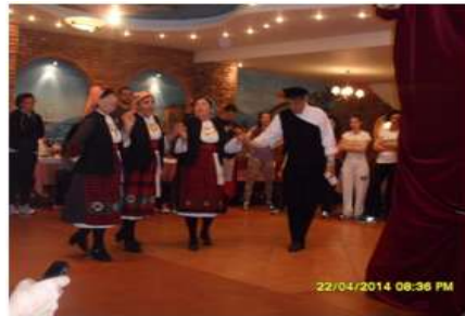
Figure 6: Vamvakofyto (Serres, region of Macedonia) (2014)

Admittedly, we have observed through this study that the place of the “authentic” and the “true” dance is in the village, and therefore, people of the village are “authentic”. At the same time, almost 100% of the participants, believed that they have acquired “authentic” knowledge in teaching dance and evening festivities: actions that constitute the main transmission sources of the dance material. The conviction that “authenticity” is transmitted within the context of the workshop is based on various perceptions that are shared amongst the participants. Thus, locals are considered to be an “authentic-pure” construct of the workshops, regardless of the place where they dance. Therefore, it is believed that within the lectures of the workshop the authentic dance form is transmitted, especially when older local dancers take part in it (see figure 6).