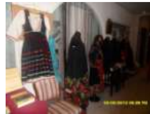
Figure 9: Costume exhibition (2013)

The organisers are aware of the challenges that arise due to the limited time of the workshop, and therefore, in order to fill the gaps within the songs and costume presentation, they adopt a practice of inviting local dancers, who represent local style of the community by demonstrating their traditional costumes. During this type of performance, participants either dance in a second (outer) circle imitating the dance of the locals and humming the lyrics, or they remain seated while they watch the locals dancing and singing (see figure 10).