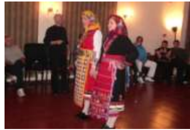
Figure 8: West Thrace (2011)

Some of the practices applied during the workshop include: inviting locals to wear traditional costumes, presenting the process of dressing into the traditional costume in its relation to the dance material, as well as costume exhibition within the workshop space (with the use of mannequins).