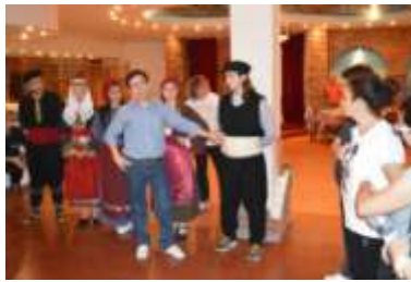
Figure 7: Assiros and Neochorouda (2013)