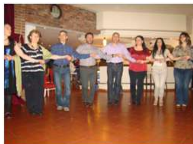
Figure 3: evening feast (2014)

For example, during the sessions of dances from Vamvakofyto (Serres, region of Macedonia) and evening festivities, local women came to participate, dressed in their traditional costumes, thus validating their authentic presence, as well as the authenticity of the dances taught. According to the instructor of Vamvakofyto, “ dances till now are intact and pure ”.